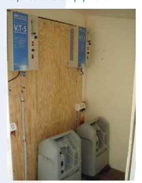
IPS60 system prior to despatch