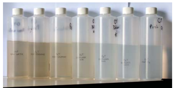
Ammonia, DOC, colour and odour removal and microbial disinfection, for Wanganui DC.