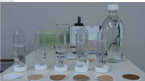
Iron, manganese removal, microbial disinfection, Process designed for Central HB DC.